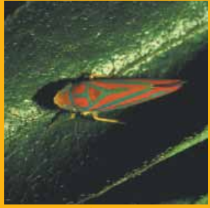
Leaf Hopper A,B,D,G,H,I,J