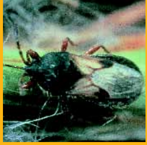
Chinch Bug A,B,D,E,H,I,J