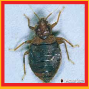
Bedbug D,F & MANY OTHERS