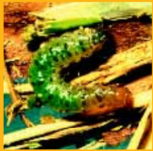
Sod Webworm B,C,H,I