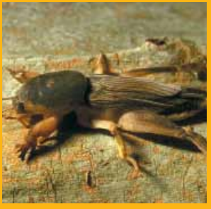
Mole Cricket B,E,H,I,J