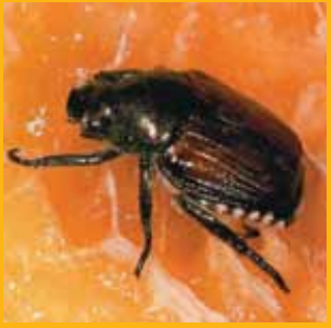
Japanese Beetle A,D,E,F,G,I