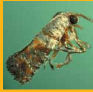
Pine Tip Moth I