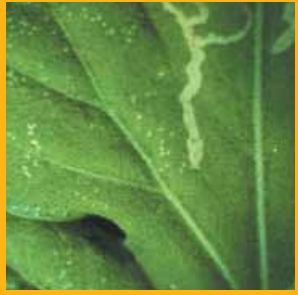
Leaf Miner A,C,D,F,G,H,I