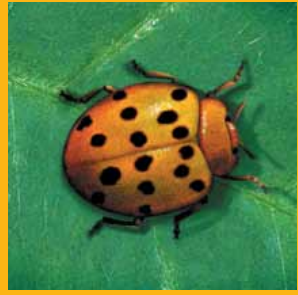
Mexican Bean Beetle A