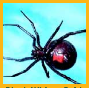
Black Widow Spider D,F,K