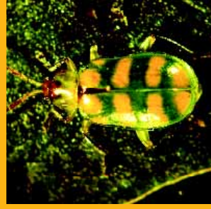
Cucumber Beetle A,D,I