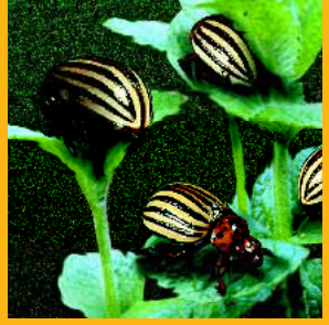
Colorado Potato Beetle A,C,D,I