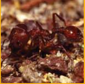
Fire Ant B,D,H,I,J