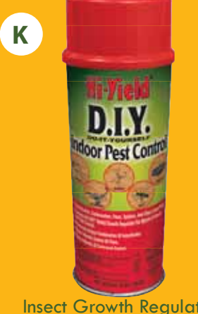
Insect Growth Regulator