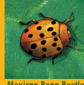
Mexican Bean Beetle