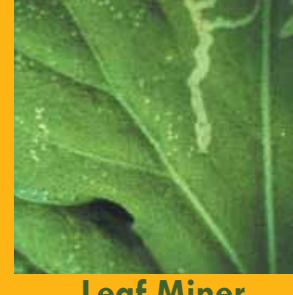
Leaf Miner A,C,D,F,G,H,I