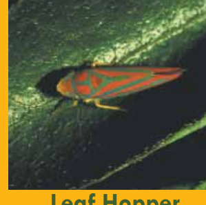
Leaf Hopper A,B,D,G,H,I,J